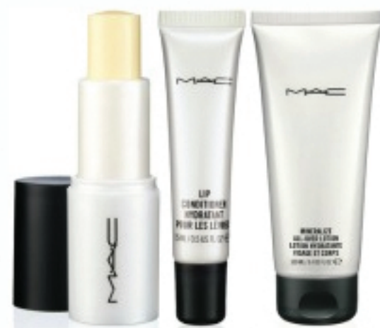
Protect your lips

In cooler weather, you would need to have a very good moisturizer that would hydrate the skin throughout the day. If you have combination to oily skin, then I would suggest having two types of moisturizer: A heavy moisturizer to use at night with anti-aging agents and a lighter moisturizer for daytime usage.