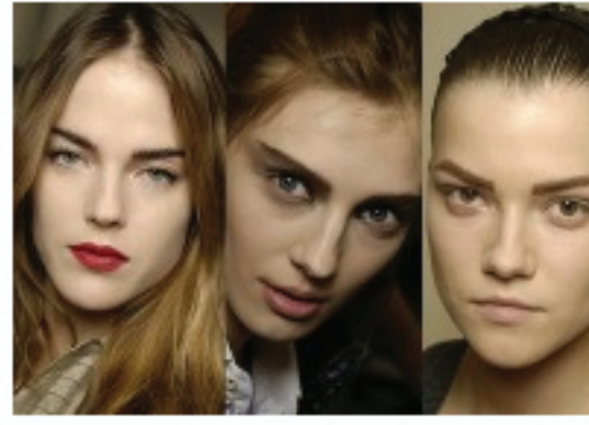
Tweezers hibernate for fall

Full eyebrows are definitely a trend now so don't wax your brows too thin. Just a clean up with a natural shape. Bikini wax is always a must! However, don't do the full Brazilian. Leaving a thin landing strip is much more sexy.