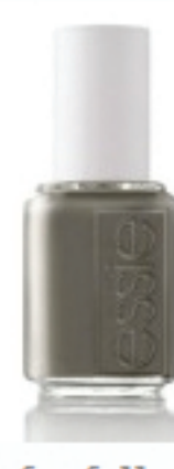
Grey nails for fall

Both OPI and ESSIE have a great fall collection. Some of my favorites are OPI: Road House Blues (Deep Sapphire) and Uh-Oh Roll Down the Window (Olive Green); ESSIE: Power Clutch (Dark Grey with Green tint) and Carry On (Dark Purple with red undertones).